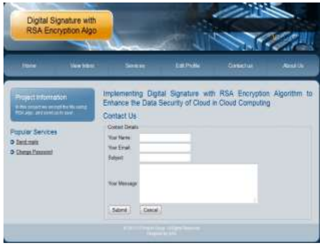
Fig 2: File Transfer

In the file transfer user can be send file to another user. The snapshot can be given as below figure.